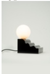
Sitting Moulure wall light